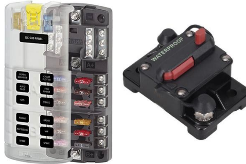
Blue Sea Systems ST Blade ATO/ATC Fuse Blocks Style Name: 12-Circ Split w/Cover & Neg