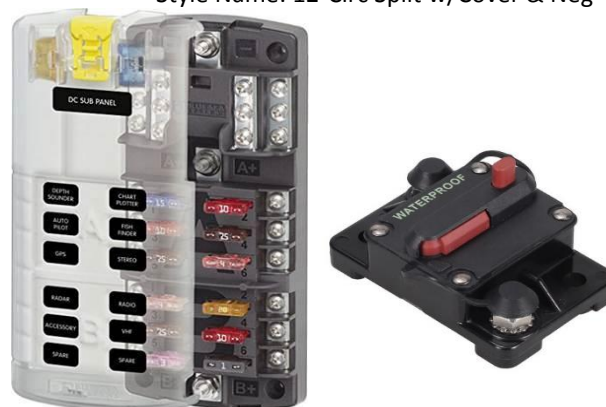
Blue Sea Systems ST Blade ATO/ATC Fuse Blocks Style Name: 12-Circ Split w/Cover & Neg

11.3 Auxiliary Accessory Fuse Block: Purpose is to wire GPS, fuel rings, JEA Radio, DC accessory power outlets etc. Wire to waterproof resettable breaker so we can isolate from the vehicle OEM system if needed. An acceptable example is listed below including picture.