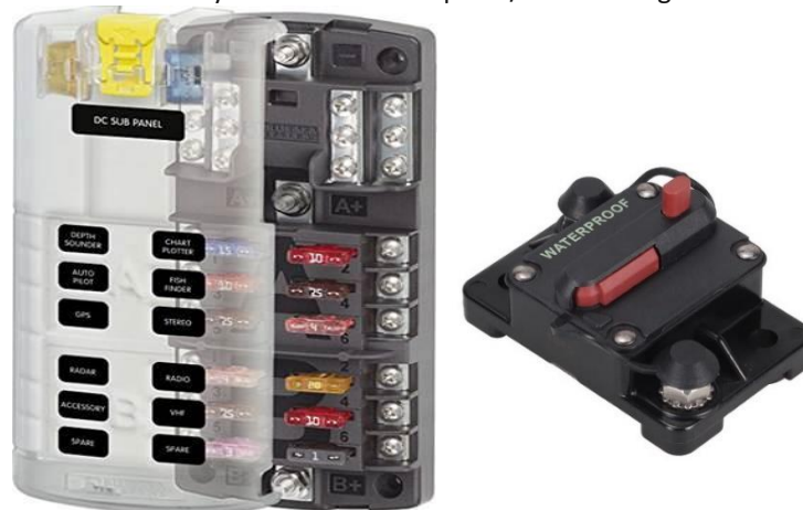
Blue Sea Systems ST Blade ATO/ATC Fuse Blocks Style Name: 12-Circ Split w/Cover & Neg

12.4 Master Switch With Lockout/Tagout: In Cab, (Mitigate Dead Batteries Due To GPS & Etc.) Example: TR Series Dual Pole Master Disconnect Switch (500A • DPST • IP67/IP69k • Integrated Lockout Tagout).