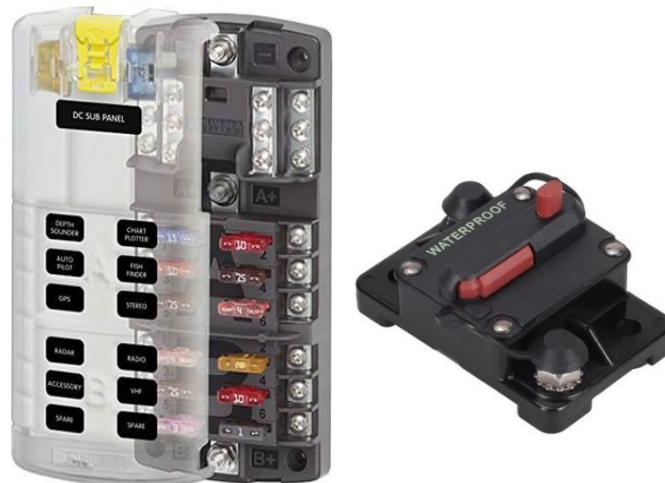
Blue Sea Systems ST Blade ATO/ATC Fuse Blocks Style Name: 12-Circ Split w/Cover & Neg