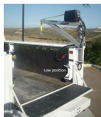
Double Corner Mount - DC Powered Mount

This mount system is designed and engineered for service trucks in which field service technicians need a lower position for the crane in order to access parking garages. Both mount positions have full lifting capacity.