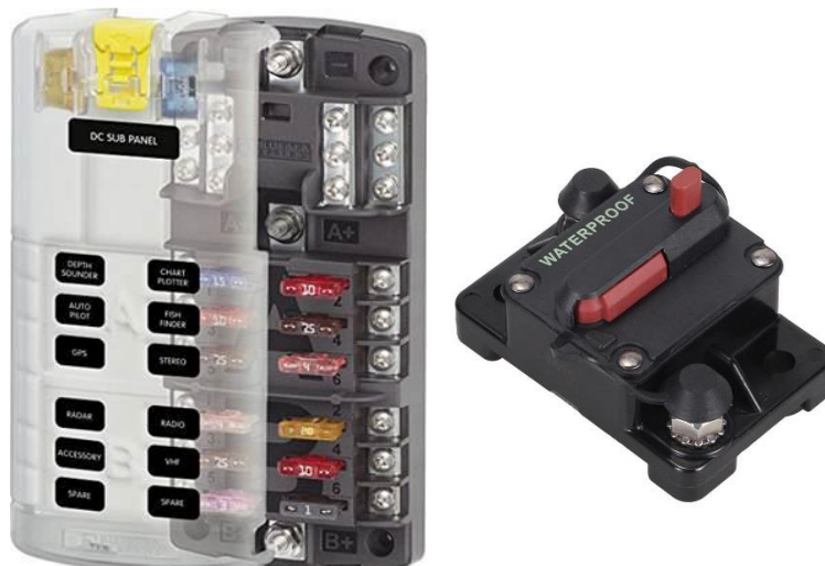
Blue Sea Systems ST Blade ATO/ATC Fuse Blocks Style Name: 12-Circ Split w/Cover & Neg

11.2 Auxiliary Accessory Fuse Block: Purpose is to wire GPS, fuel rings, JEA Radio, DC accessory power outlets etc. Wire to waterproof resettable breaker so we can isolate from the vehicle OEM system if needed. An acceptable example is listed below including picture.