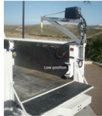
Double Corner Mount - DC Powered Mount

This mount system is designed and engineered for service trucks in which field service technicians need a lower position for the crane in order to access parking garages. Both mount positions have full lifting capacity.