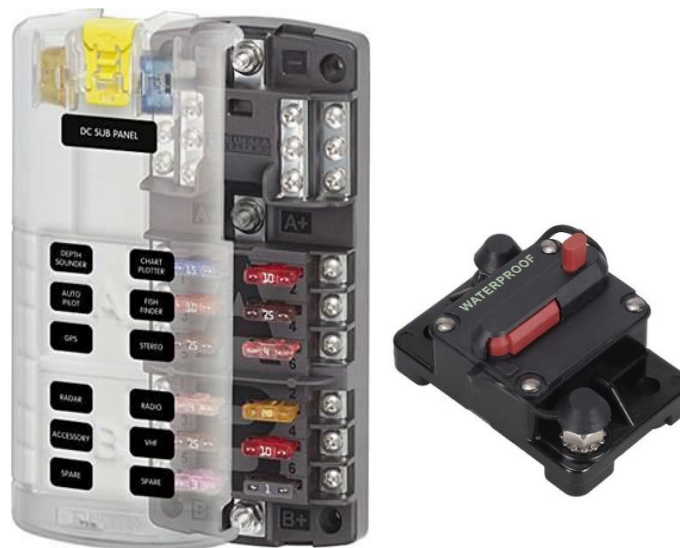
Blue Sea Systems ST Blade ATO/ATC Fuse Blocks Style Name: 12-Circ Split w/Cover & Neg

8.2 Auxiliary Accessory Fuse Block/Lugs: To wire GPS, fuel rings, JEA radio, DC accessory power outlets & etc. See Example Below. Wire to waterproof resettable breaker so we can isolate from vehicle if needed. An acceptable example is listed below including picture: