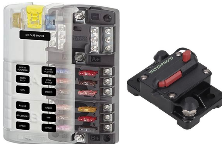
Blue Sea Systems ST Blade ATO/ATC Fuse Blocks Style Name: 12-Circ Split w/Cover & Neg

11.2 Auxiliary Accessory Fuse Block: Purpose is to wire GPS, fuel rings, JEA Radio, DC accessory power outlets etc. Wire to waterproof resettable breaker so we can isolate from the vehicle OEM system if needed. An acceptable example is listed below including picture.