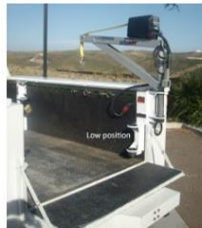
Double Corner Mount - DC Powered Mount

This mount system is designed and engineered for service trucks in which field service technicians need a lower position for the crane in order to access parking garages. Both mount positions have full lifting capacity.