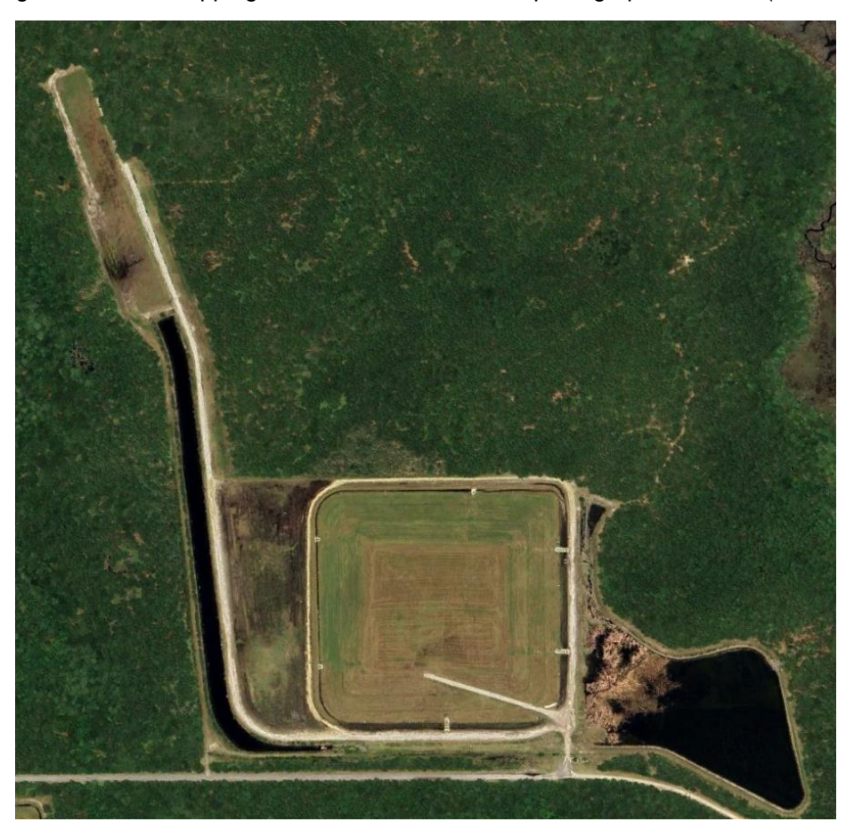
Figure 2: Aerial Photograph (Google Earth<sup>1</sup>)

The primary changes in the geometry of BSA-B since the past annual inspection are due to the closure construction of the BSA-B and the relocation of materials from the western portion of the Phase I footprint to the closed BSA-B. Closure construction entailed the construction of bench ditches, stormwater management features, and geomembrane capping of CCRs. A recent aerial photograph of BSA-B (dated June 2023) is provided on Figure 2.