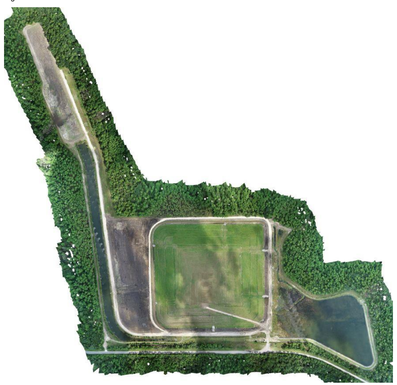
Figure 2: Aerial Photograph

The primary changes in the geometry of BSA-B since the past annual inspection are due to the closure construction of the BSA-B and the relocation of materials from the western portion of the Phase I footprint to the closed BSA-B. Closure construction entailed the construction of bench ditches, stormwater management features, and geomembrane capping of CCRs. A recent aerial photograph of BSA-B (dated September 2021) is provided on Figure 2.