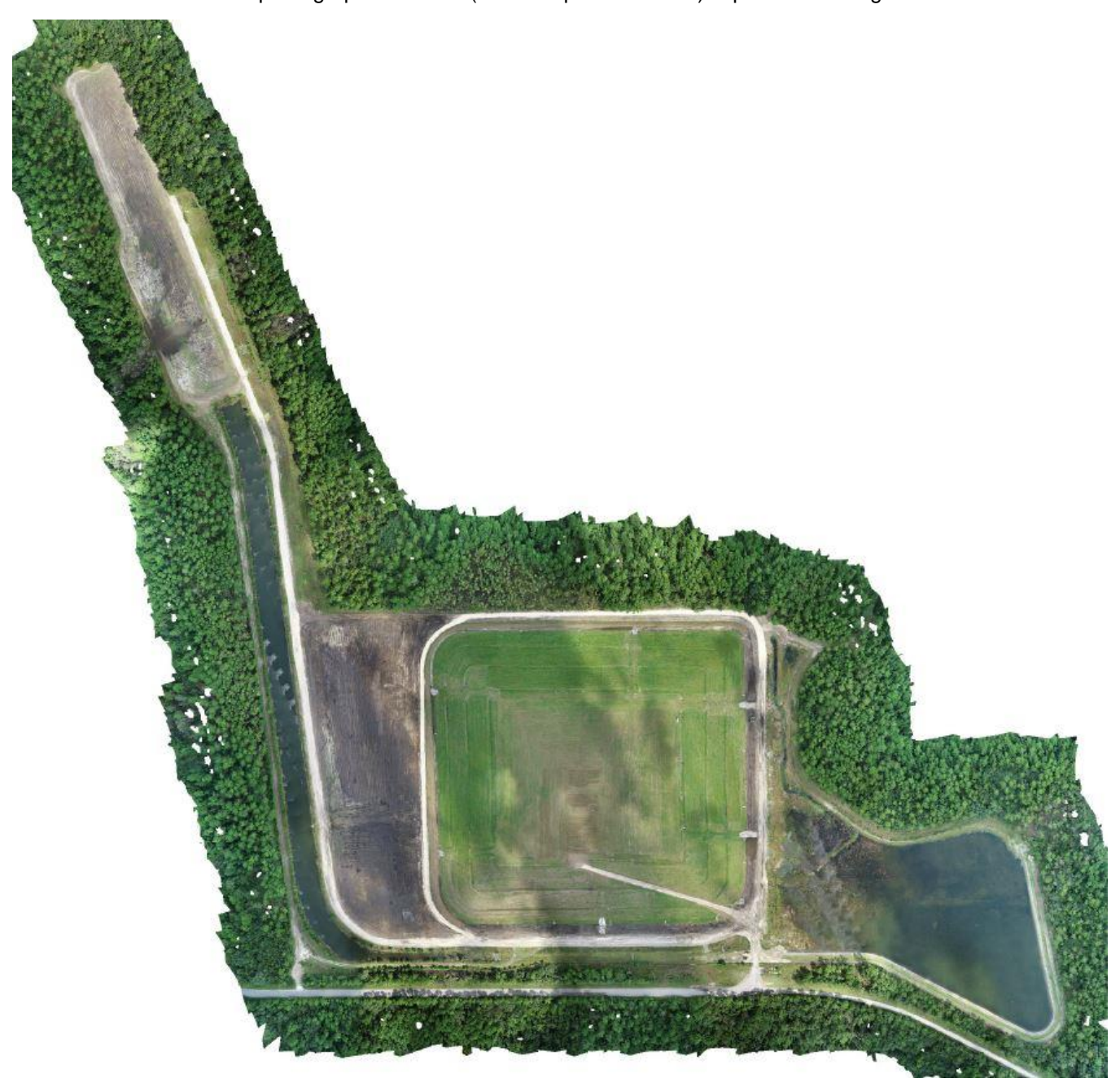
Figure 2: Figure 2 - Aerial Photograph

The primary changes in geometry of BSA-B since the past annual inspection are due to closure construction of the BSA-B and relocation of materials from the western portion of the Phase I footprint to the closed BSA-B. Closure construction entailed construction of bench ditches, stormwater management features, and geomembrane capping of CCRs. A recent aerial photograph of BSA-B (dated September 2021) is provided on Figure 2.