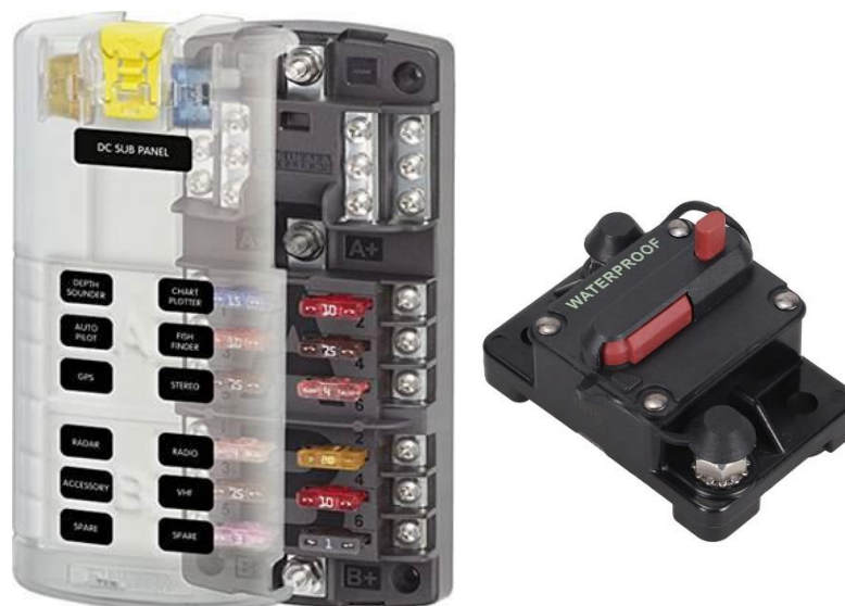
Blue Sea Systems ST Blade ATO/ATC Fuse Blocks Style Name: 12-Circ Split w/Cover & Neg