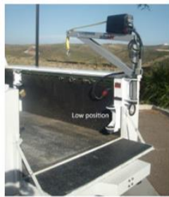
Double Corner Mount - DC Powered Mount

This mount system is designed and engineered for service trucks in which field service technicians need a lower position for the crane in order to access parking garages. Both mount positions have full lifting capacity.