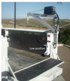
Double Corner Mount - DC Powered Mount

This mount system is designed and engineered for service trucks in which field service technicians need a lower position for the crane in order to access parking garages. Both mount positions have full lifting capacity.