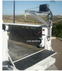
Double Corner Mount - DC Powered Mount

This mount system is designed and engineered for service trucks in which field service technicians need a lower position for the crane in order to access parking garages. Both mount positions have full lifting capacity.