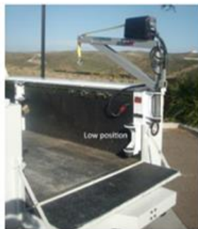
Double Corner Mount - DC Powered Mount

This mount system is designed and engineered for service trucks in which field service technicians need a lower position for the crane in order to access parking garages. Both mount positions have full lifting capacity.