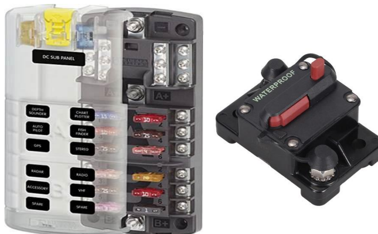
Blue Sea Systems ST Blade ATO/ATC Fuse Blocks Style Name: 12-Circ Split w/Cover & Neg

11.2 Auxiliary Accessory Fuse Block: Purpose is to wire GPS, fuel rings, JEA Radio, DC accessory power outlets etc. Wire to waterproof resettable breaker so we can isolate from the vehicle OEM system if needed. An acceptable example is listed below including picture