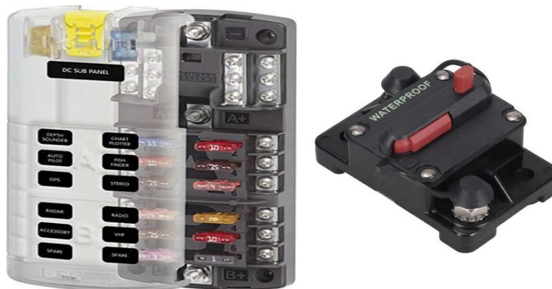
Blue Sea Systems ST Blade ATO/ATC Fuse Blocks Style Name: 12-Circ Split w/Cover & Neg