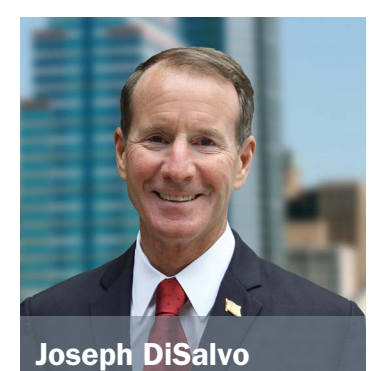
Appointed on April 14, 2020