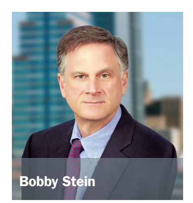
Appointed on April 14, 2020 Term Ending on February 28, 2025

Appointed on September 28, 2021 Term Ending on February 28, 2024