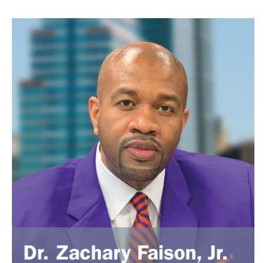
Appainted on April 14, 2020

Appointed on April 14, 2020 Term Ending on February 28, 2026