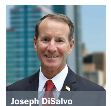
Appointed on April 14, 2020 Term Ending on February 28, 2026