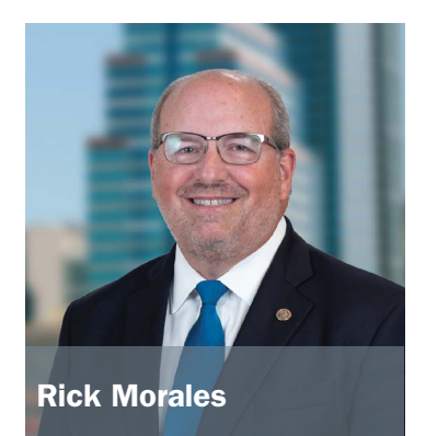
Appointed on September 28, 2021 Term Ending on February 28, 2024