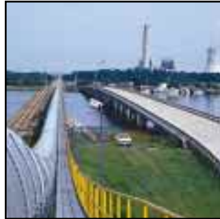
Coal travels to Power Park on this enclosed conveyor system.

A conveyor is used to transfer coal from the rail rotary dumper facility to the coal storage area, which is capable of holding 1 million tons of coal, or a 90-day supply. A coal stacker-reclaimer