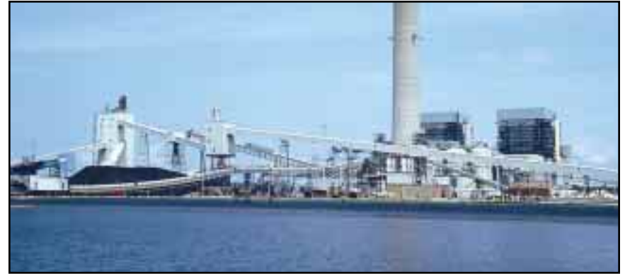
The wastewater collection pond is lined with thick plastic for groundwater protection. The enclosed coal conveyor system appears in the background.

of 50,000 people. In addition, Power Park has its own sanitary wastewater treatment plant that can treat 30,000 gallons per day, and three on-site production wells which supply water for personnel needs, fire protection and overall plant operations.