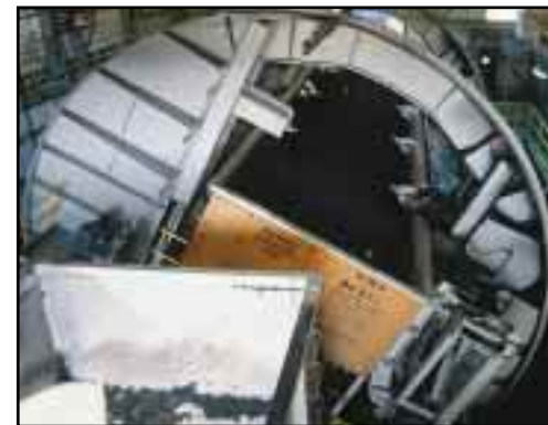
A coal car is unloaded on the rotary dumper.

The coal delivered by rail comes from mines located in Kentucky and West Virginia, and is transported by CSX Transportation Inc. on four utility-owned, 90-car unit trains. Each