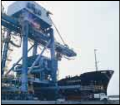
A ship at the Coal Terminal readies for unloading.

moves within the coal storage area on a set of railroad tracks, stacking the coal and then retrieving it in buckets attached to a large wheel for movement into the Power Park's Unit 1 and 2 boilers on an enclosed, 2,100-foot-long conveyor system.