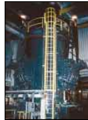
Coal pulverizer unit.

An ongoing commitment to operating in an environmentally safe manner is evident in the state-of-the-art environmental control equipment utilized at the coal terminal. The ship unloader is equipped with a dry dust collection system and a wet dust suppression system that controls coal dust during unloading.