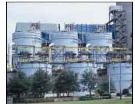
Scrubbers remove sulfur from the boiler exhaust gas.

Two of the largest structures at Power Park are the