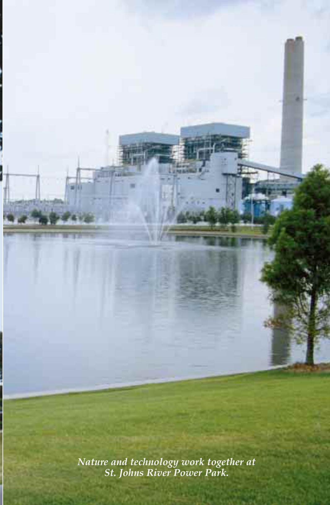
Nature and technology work together at St. Johns River Power Park.