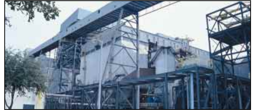
Unit 1 precipitator removes particulates from boiler exhaust gas.

art technology for environmental protection. For example, approximately 35 percent, or $480 million of the $1.6 billion project, was used for the purchase of air and water quality control equipment.