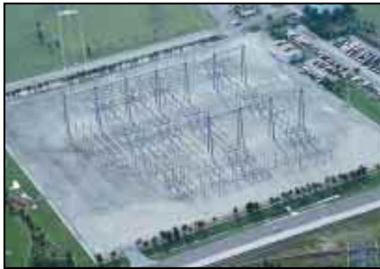
Aerial view of electric switchyard.