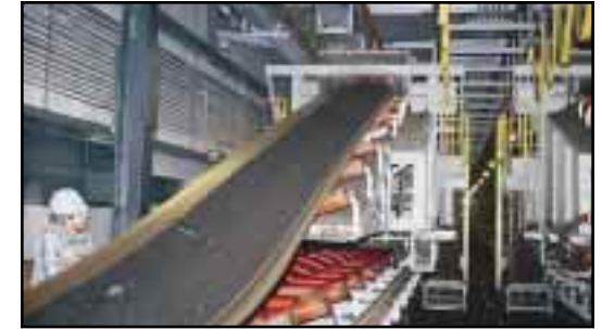
Coal moves up the conveyor to the boiler from the coal storage area.

The coal is then placed onto the conveyor where it begins its 3.2-mile journey to the Power Park coal storage area. The conveyor runs at about 10 miles per hour and can handle about 1,500 tons of coal per hour, and changes direction at each of seven transfer stations.