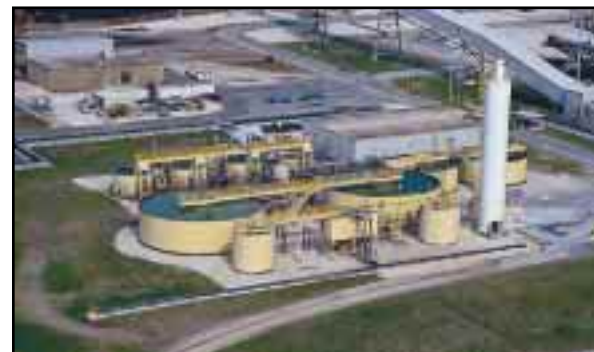
Aerial view of wastewater treatment facility.

Major plant byproducts like bottom ash, fly ash and synthetic gypsum are collected and processed for sale through Power Park's Byproduct Marketing Program or for on-site disposal at Power Park's 531-acre landfill. Bottom ash, a byproduct of burning coal, is collected from the bottom of the boilers. It is marketed for the manufacture of cement, concrete blocks, synthetic aggregate for road construction and as a synthetic soil amendment. Fly ash is collected from the electrostatic precipitators and is used by the cement and concrete industries as a bonding agent. Synthetic gypsum, which is a byproduct of the scrubbers, is sold for both