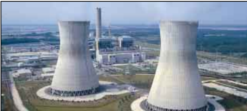
Steam rises from the Unit 1 and Unit 2 cooling towers.

Wastewater generated at Power Park is collected at several collection ponds and treated in a central wastewater treatment facility. Each collection pond is lined with a high density polyethylene material for groundwater protection. This facility is designed to treat up to 3,500 gallons of wastewater per minute, an amount equal to the wastewater treatment required for a city