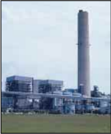
This 640-foot-tall concrete stack contains two separate chimneys - one for each unit.

reinforced concrete natural draft cooling towers. Each tower is 460 feet tall and 370 feet across at its base. They are designed to cool the main condensers of both Power Park units and use water taken from the Northside Generating Station discharge channel. This water initially comes from the St. Johns River and is used to make up for water lost through evaporation. It is pumped through the Power Park condenser to a distribution system inside the cooling tower, and flows over a structure resembling a radiator core. The design of the