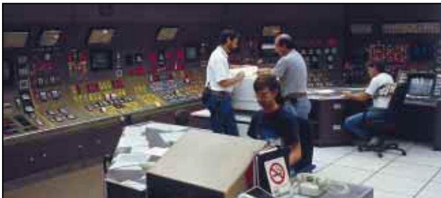
Control room personnel monitor plant operations.