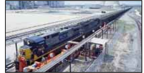
Unit coal train enters Power Park.

by improvements in operational activities. The additional megawatts result in an avoided construction cost of $28.8 million and avoided replacement power costs of $2 million annually.