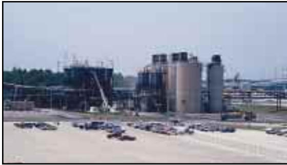
Solid waste handling area.

space while reducing landfill costs. As a result, Power Park's landfill life of 40 years can be extended.