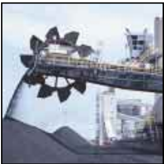
The coal stacker-reclaimer moves through the coal storage area.

Coal transported by ocean-going ship or barge is delivered to the St. Johns River Coal Terminal, located on a 30-acre site on Blount Island. The coal terminal began its commercial operation on January 6, 1989 after 21 months of construction and can handle up to 3 million tons of coal per year. The coal terminal provides economic benefits to JEA and FPL since it provides an alternative to rail