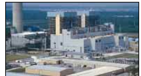
Unit 1 and Unit 2 boilers.

Before the coal reaches the boiler, seven coal pulverizers for each unit grind it to the consistency of talcum powder. The pulverized coal