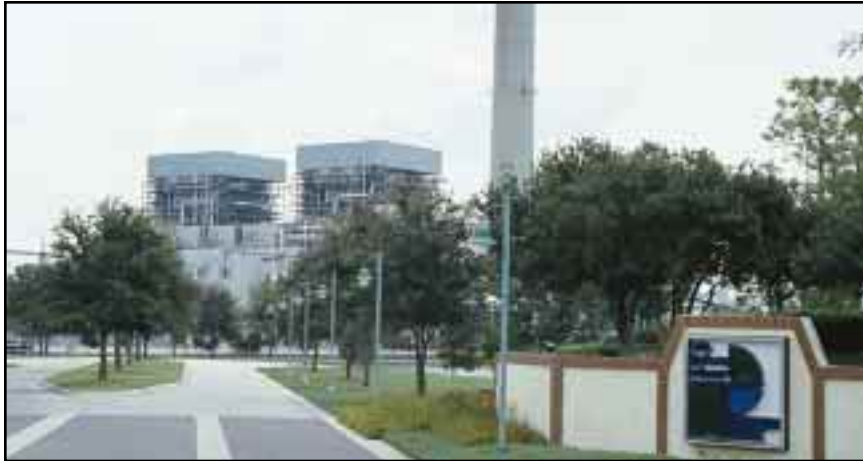
St. Johns River Power Park.

The St. Johns River Power Park (Power Park), located on a 1,900-acre site in northeast Jacksonville, is a coal-fired electric power generating station jointly operated by the Jacksonville Electric Authority (JEA) and the Florida Power and Light Company (FPL). Each utility receives 50 percent of Power Park's capacity and energy output, which creates a good example of the continuing partnership between local government and the private sector. Power Park represents Florida's largest municipally-owned utility joining with its largest investor-owned utility to provide reliable electric energy at stable prices to their customers.